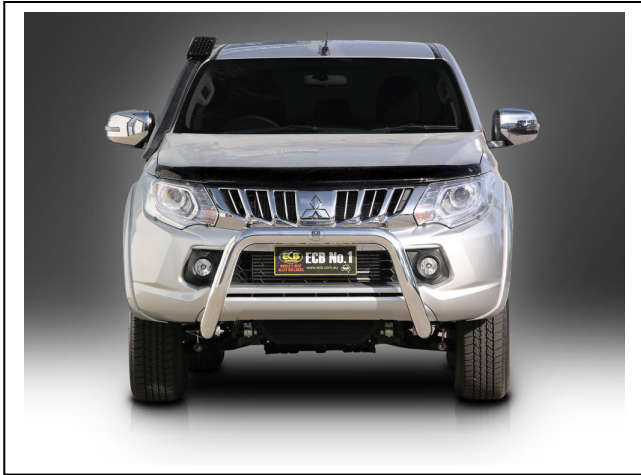
Figure 4: 76mm Nudge Bar front view