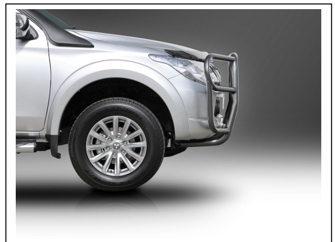
Figure 9: Type 8 Bar side view