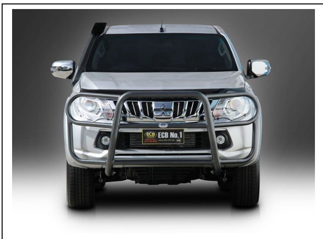
Figure 8: Type 8 Bar front view