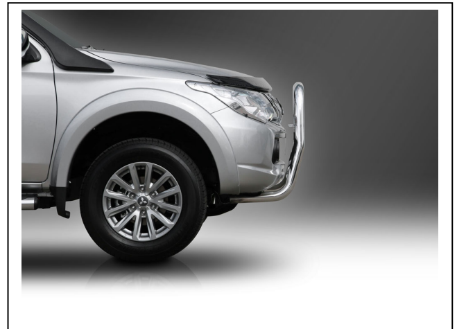
Figure 7: 76mm Series 2 Nudge Bar side view