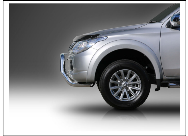
Figure 5: 76mm Nudge Bar side view