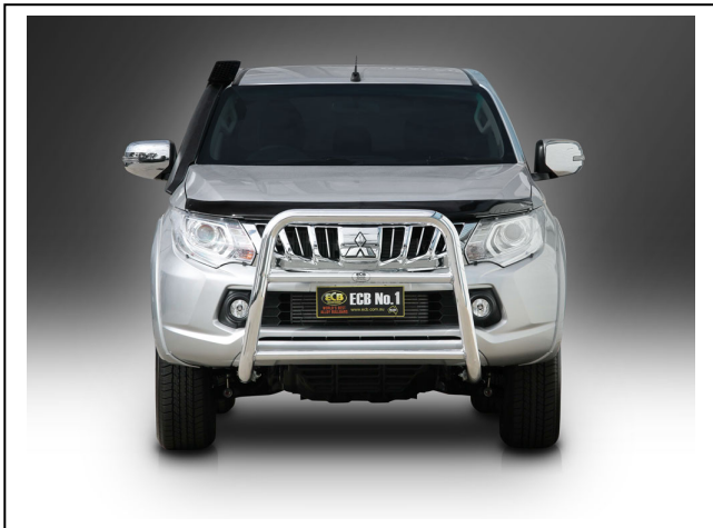
Figure 6: 76mm Series 2 Nudge Bar front view